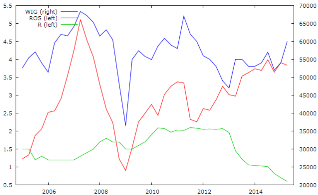
Figure 1. Selected time series